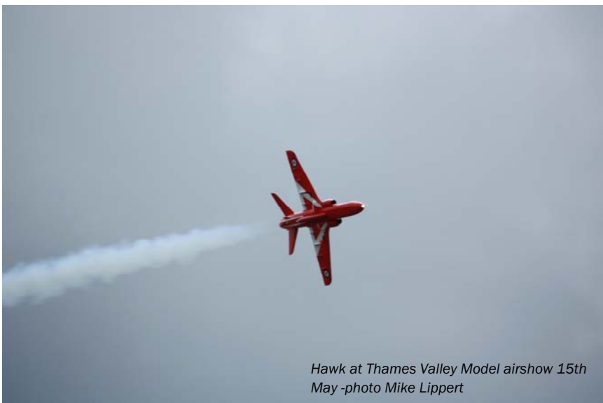
Hawk at Thames Valley Model airshow 15th May

This notice is being sent to those who have rejoined already by e-mail and by post to those who have not yet rejoined.